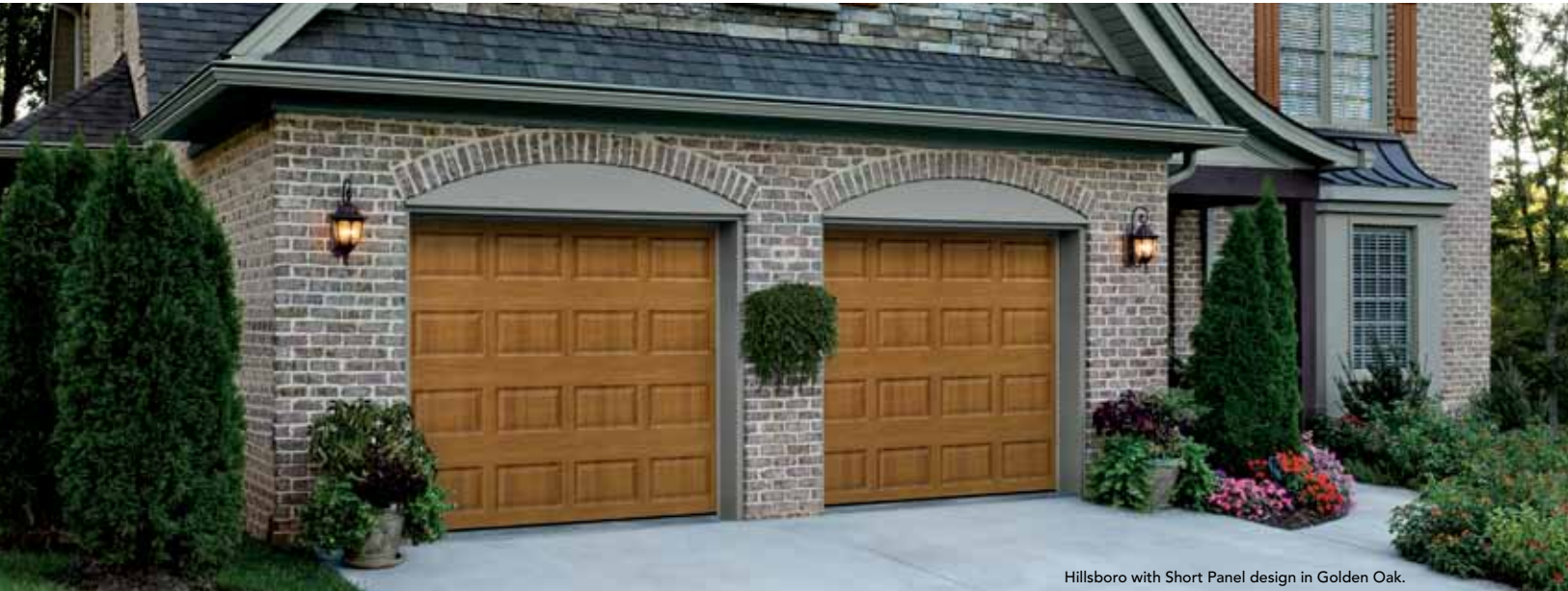
Hillsboro with Short Panel design in Golden Oak.

Available on: PELLA® THERMASTAR BY PELLA®