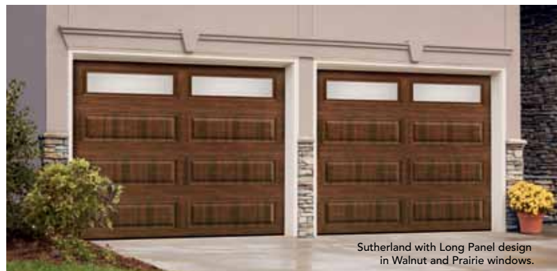
Sutherland with Long Panel design in Walnut and Prairie windows.