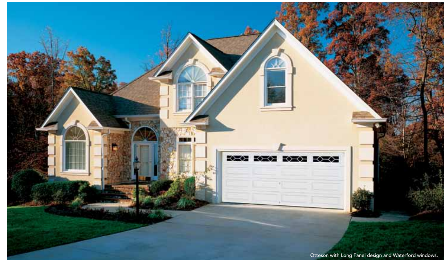
Otteson with Long Panel design and Waterford windows.