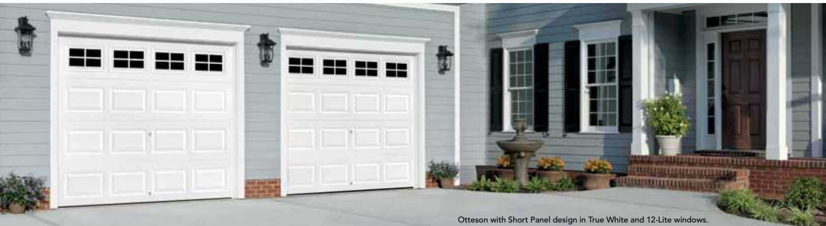
Otteson with Short Panel design in True White and 12-Lite windows.

Same traditional appeal. Different reasons to buy.