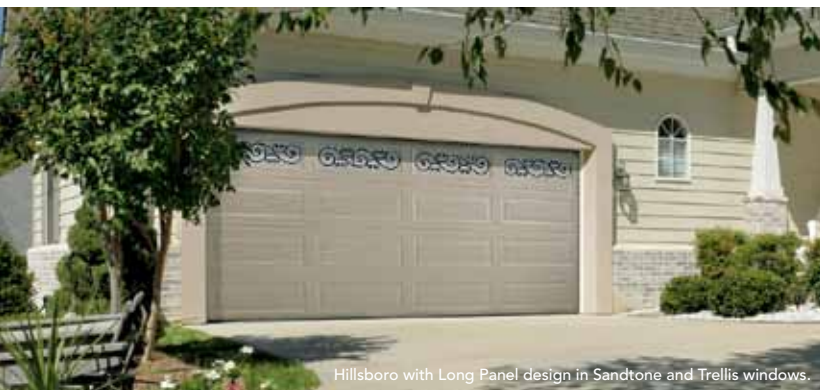
Hillsboro with Long Panel design in Sandtone and Trellis windows.